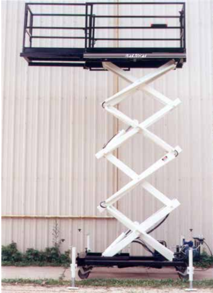
MP STANDARD (shown with optional Extenda-deck)